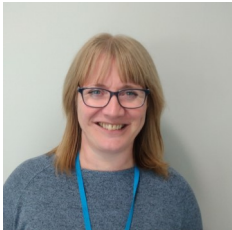
Marion Astin School and Parent Therapist